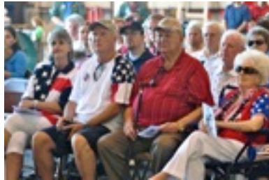
A patriotic crowd (above) listens attentively during the ceremony. Later they all enjoyed a lunch (below) prepared by HSW