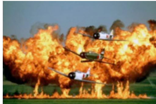
Article and photo source:

The "Tora! Tora! Tora!" performances and all air show activities are included with AirVenture admission.