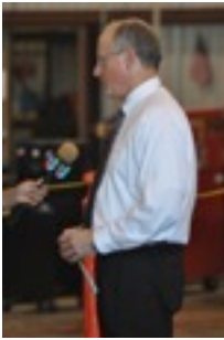
Congressman Mike Conaway (above) addresses the Memorial Day crowd. Texas Raiders (below) fires up its engines in preparation for take-off