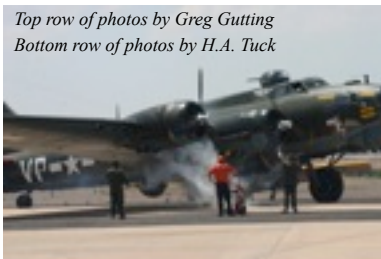
Top row of photos by Greg Gutting Bottom row of photos by H.A. Tuck