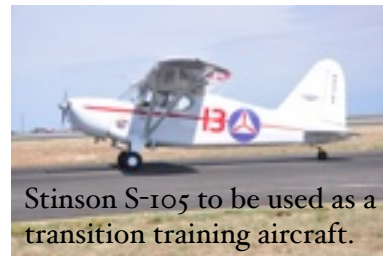
Stinson S-105 to be used as a transition training aircraft.

By the time you read this, it is more than likely that all crew positions will have been filled. But...you might still contact James ( james.a.martin@me.com ) to get on the list. Feel free to contact me ( dadiggins@pinnaclecng.com ) for information on our participation in future air shows.