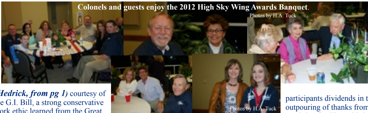
Colonels and guests enjoy the 2012 High Sky Wing Awards Banquet.